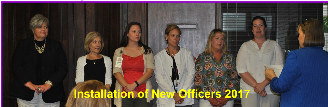
Installation of New Officers 2017